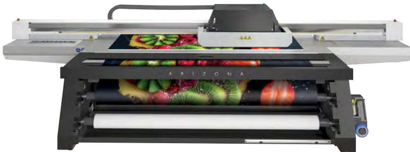
Océ Arizona 1300 Series Printer

DO IT NOW: No warm up required. The instant-on capability lets you start printing immediately.